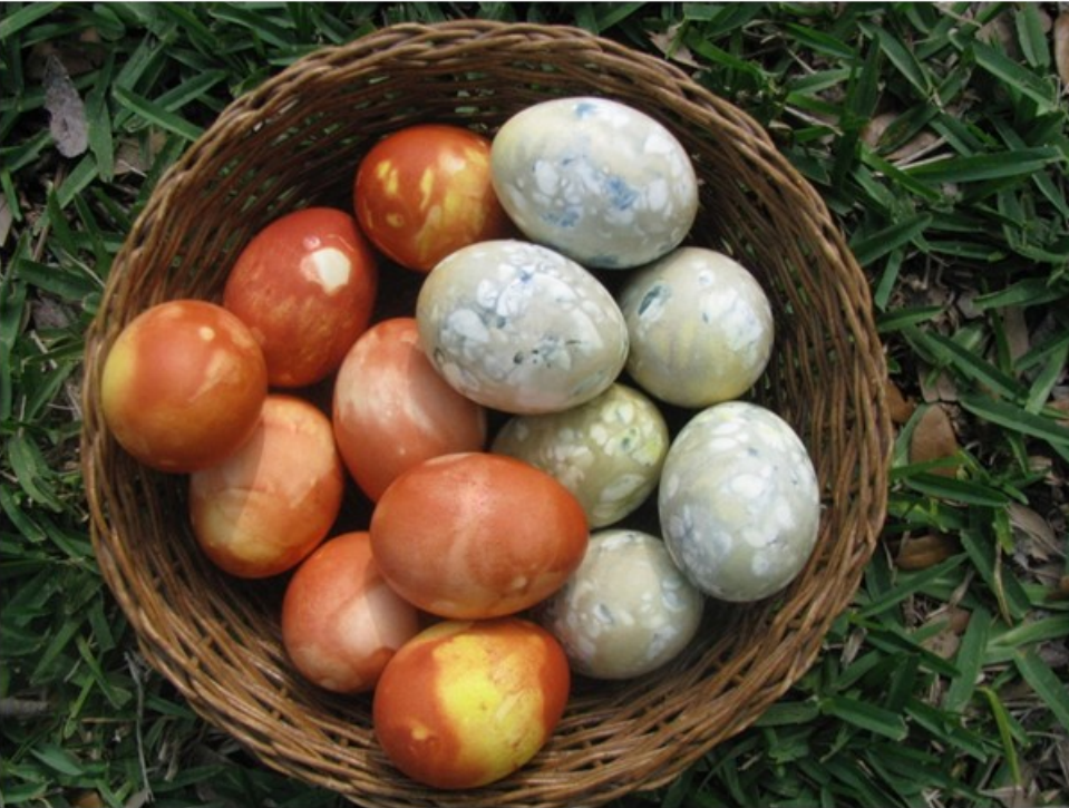
Easter eggs dyed using natural dyes—from onion skins (the gold, yellow, and brown eggs) and bluebonnets (the blue, gray, and white eggs)