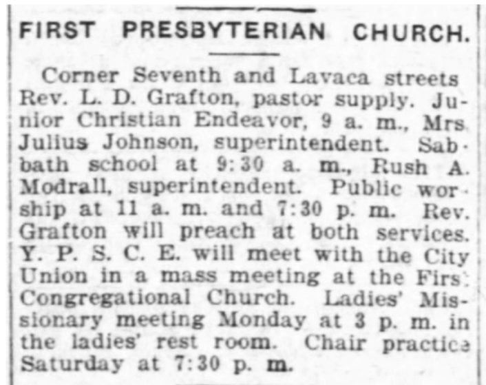
2/7/1920 Austin American-Statesman Y.P.S.C.E is the Young People's Society of Christian Endeavour.