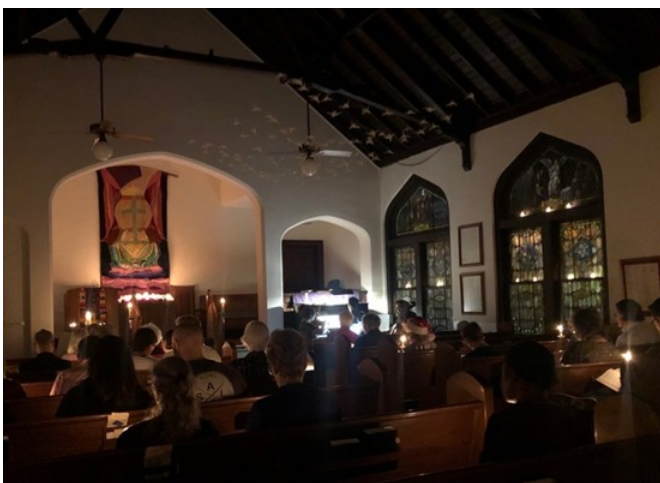
12/15/19 The carol and candlelight service was well-attended