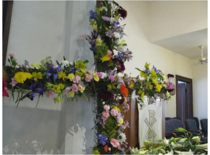
The flowered cross