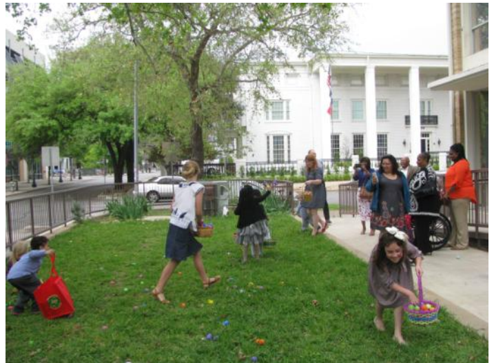
Children enjoying the Easter egg hunt