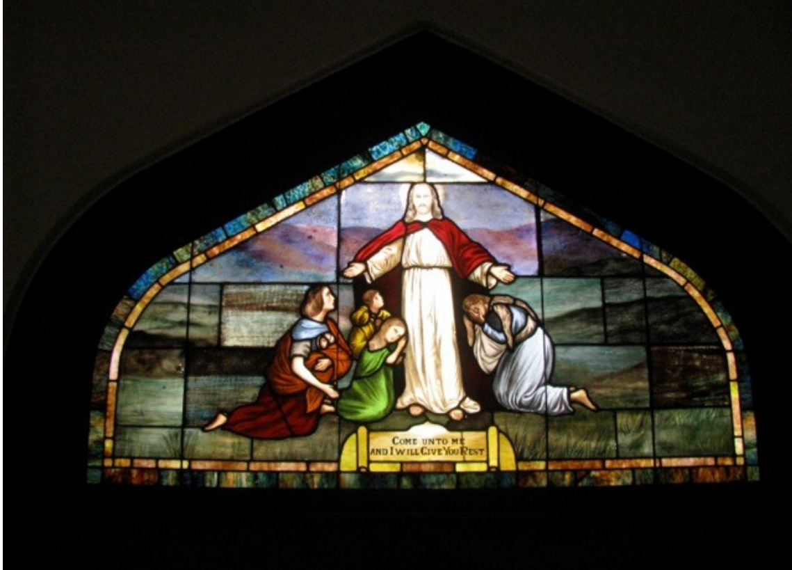
One of the original stained glass windows from the first church building built in 1906.

E aster Sunday, fell on April 7 in 1901—an important date in our church history. You'll see why when you read below. You can read a great deal more about the history of our church at: http://server16.websitehostserver.net/~patandme/CAHistory/index.html