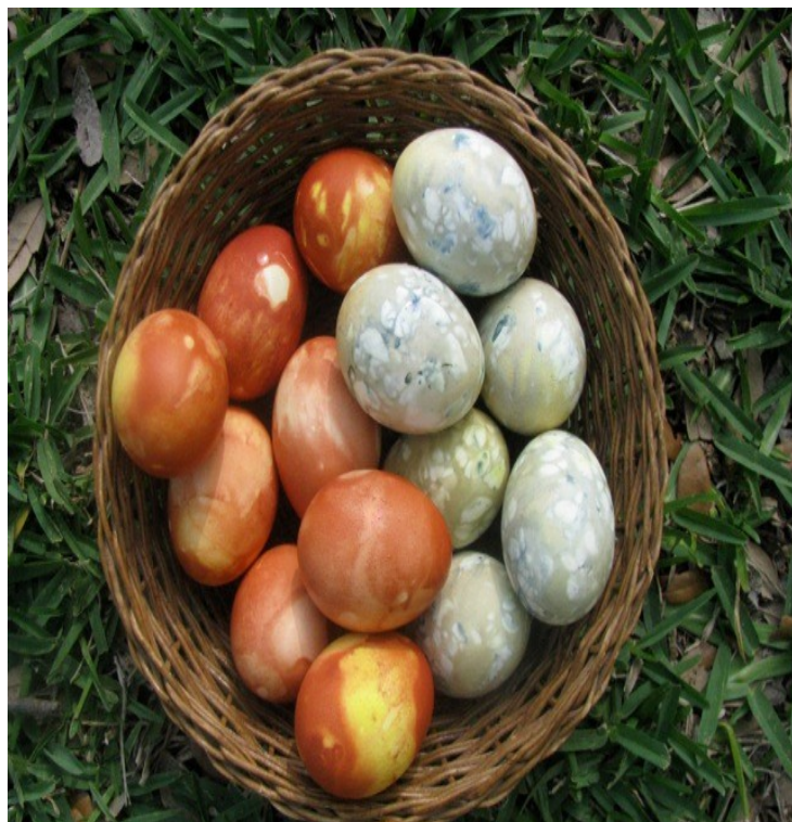
Easter eggs dyed with natural dyes in the style of early German settlers in Fredericksburg—onion skin eggs on the left and bluebonnet eggs on the right.