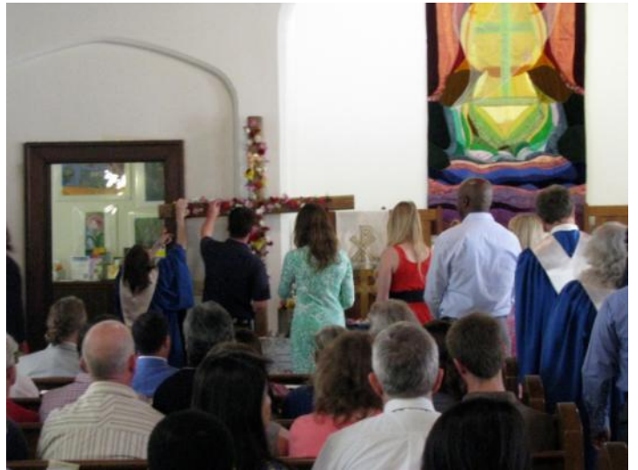
The flowering of the cross on Easter Sunday and the flowering of the cinder block in memory of Joyce Smith.