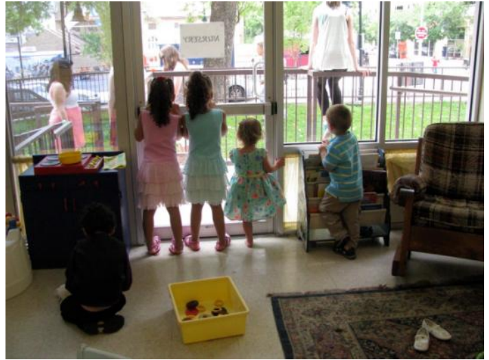
The younger children were anxiously awaiting permission to go out and hunt Easter eggs.