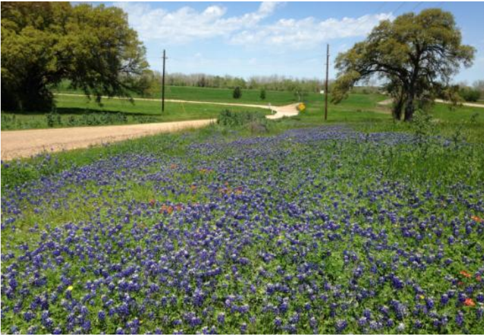
It is definitely spring in Central Texas. We had rains in October—virtually none before or since—but just in time for the flowers.