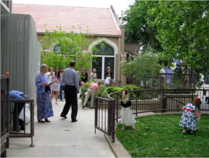
The Easter egg hunt was fun for everyone.