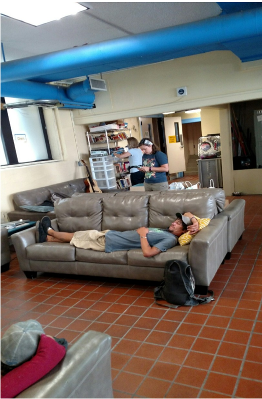
Volunteers sort donated clothing; clients take a nap.