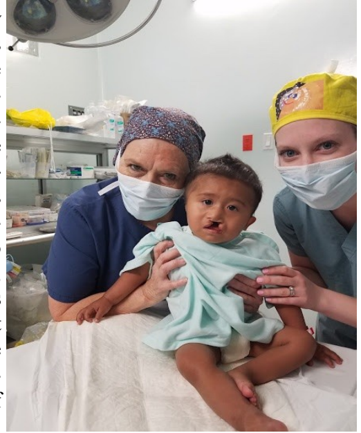
4/17 Before shot of child having SMILE surgery: