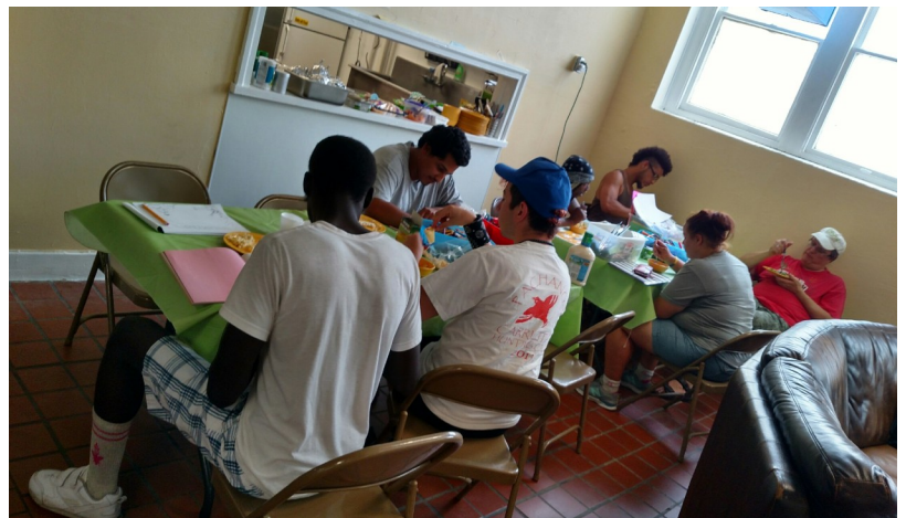
It's Art Group time: also never too late for a bite to eat!

When I arrived to take a few pictures and maybe get some feedback from clients being served, it was Art Group time. About a