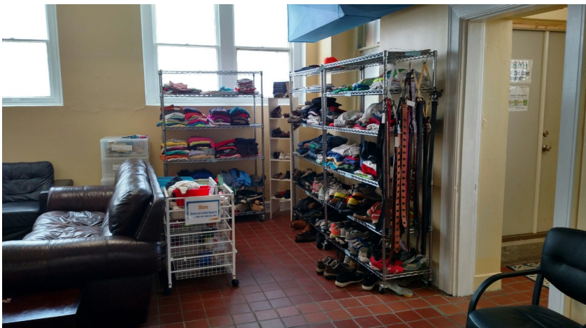
Donations of clothing and other items are neatly organized just right of the main entrance area to SYM.

volunteers were sorting through a pile of clothing. Relaxed, friendly atmosphere. Some of the art-group participants agreed to say something about what the program means to them. Excerpts from their comments to me follow.