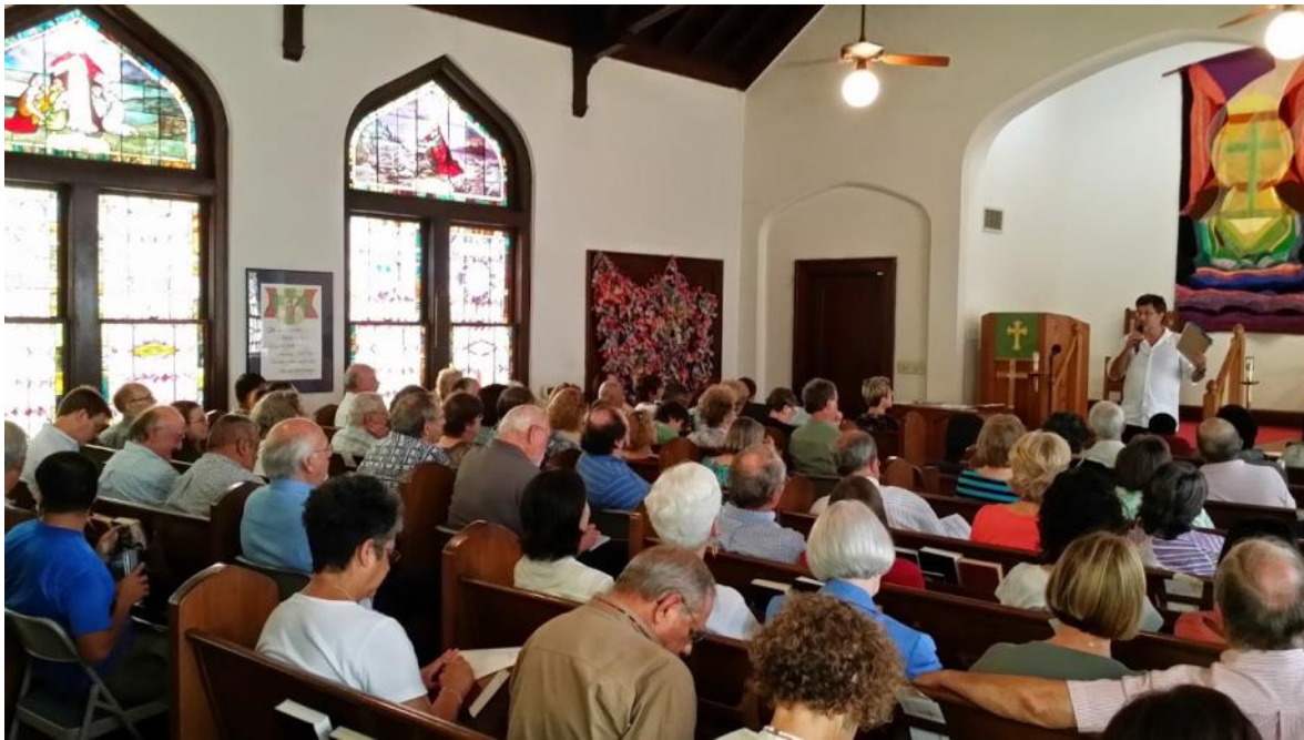
An Action Form and Discussion was held at the church on August 24th to discuss public policies that could address the crisis involving refugee children crossing the border into the U S. Guest presenters spoke about the pressing needs of the refugee children who are arriving in Central Texas as well as how this humanitarian crisis affects the debate over immigration reform.