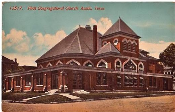
9th and Colorado First Congregational Church of Austin building--about 1910. Note the windows--they were moved to the new church on 23rd St. in 1921.