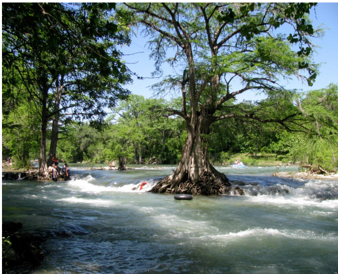
4/24/10 A beautiful afternoon at Slumber Falls