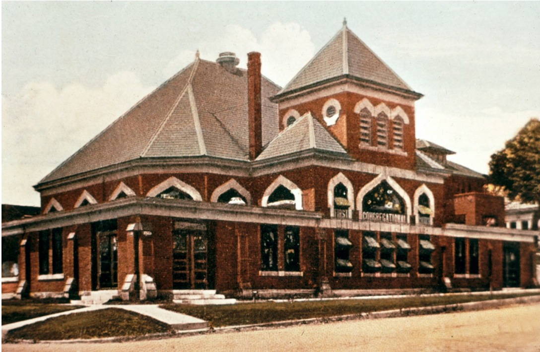
About 1920—the First Congregational Church. You can see Colorado Street. at the front. You can also recognize the shapes of the windows which were moved when our present church building opened about 1921.