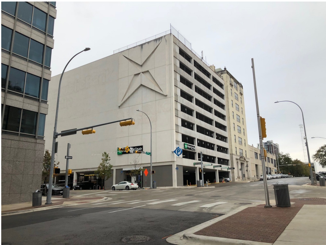
This building, still a parking garage, currently occupies the southwest corner of the intersection of 9th and Colorado—Colorado Street. is running south to north (left to right) and 9th St. east to west (left to right)